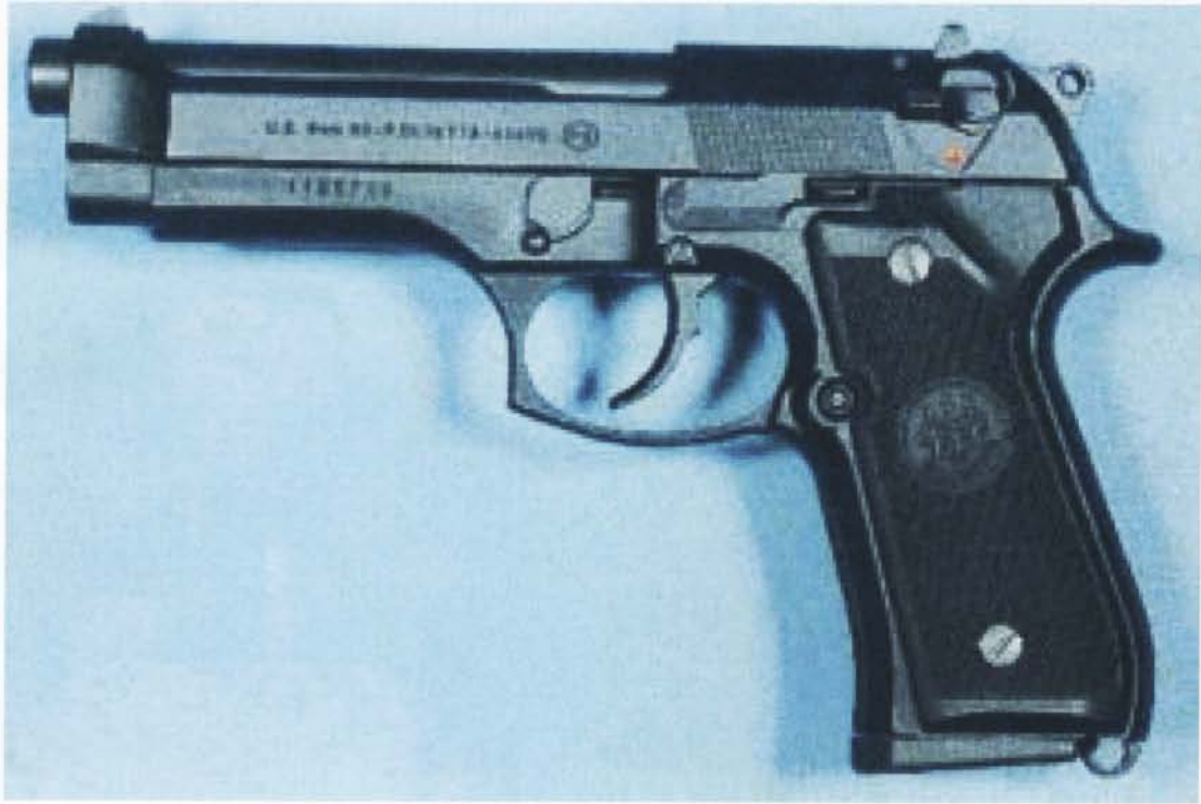
EXHIBIT 'A' TO BALLISTICS REPORT